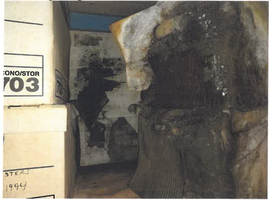
#24- Room 23 A Showing Mold Growth on Box