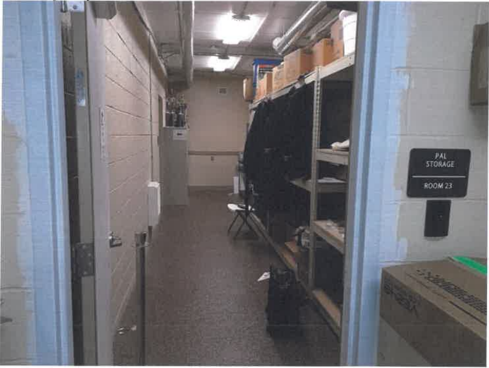
#10- Room 23 Showing Rifles on Shelf