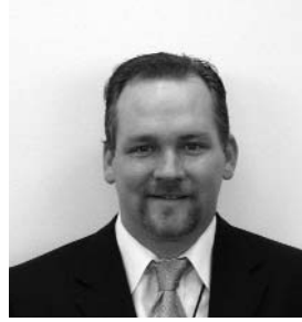
JEFFREY IGNATOWITZ Deputy Attorney General